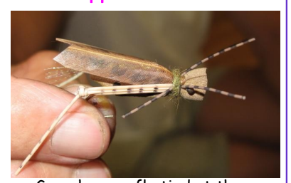
Grasshopper fly tied at the September fly tying class