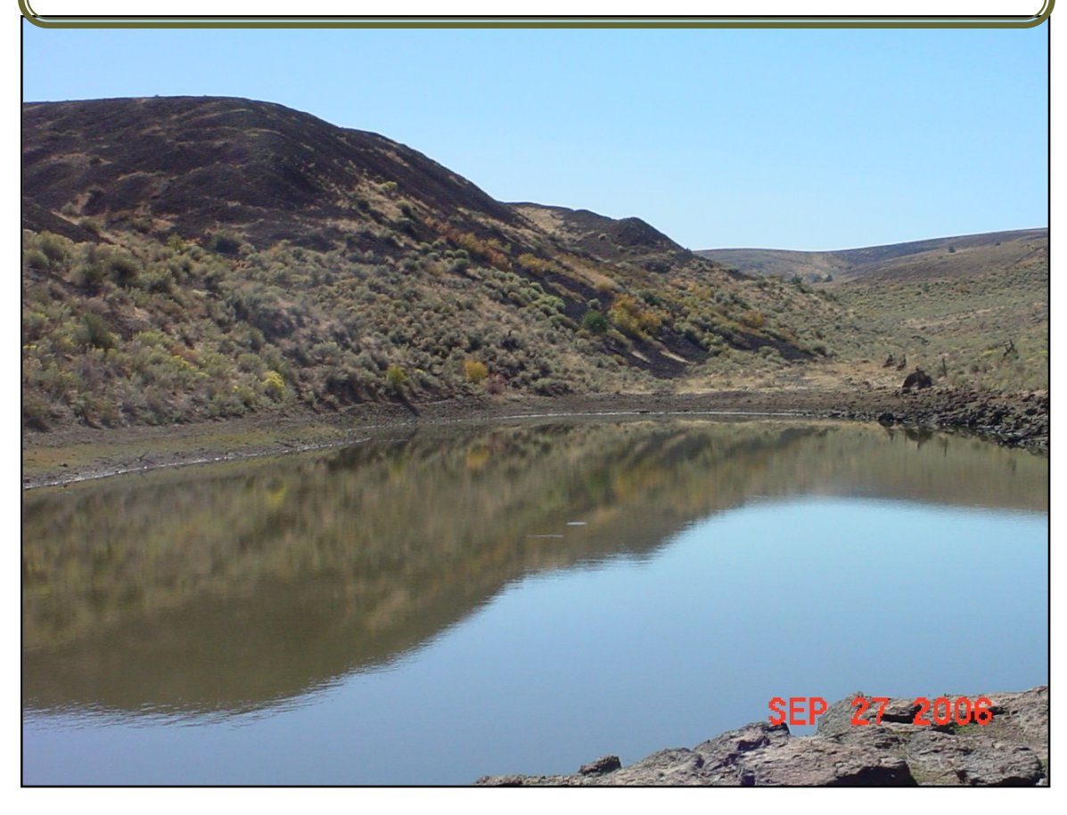
South Cottonwood Reservoir looking west or upstream

In southeastern Oregon, water storage in large irrigation reservoir is inconsistent at best. During the last decade, many of our large reservoirs filled and spilled only once and had carryover water once or twice. In most cases, our most consistent trout fisheries are located in small multipurpose reservoirs constructed in the last 50 years. These reser-