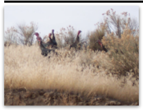
Flock of wild turkeys at the Owyhee