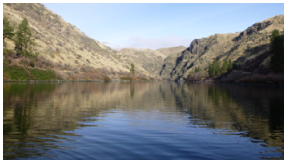
Life is not a journey to the grave with the intent of arriving safely and in one pretty and well preserved piece.....but to skid in sideways thoroughly used up, worn out and defiantly shouting, WOW, WHATA RIDE!!!!!!