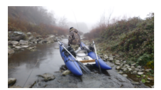
Rough road to get there