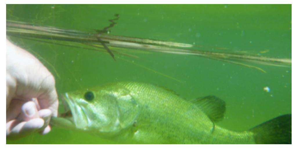
Photo caption....the Bass of the near accident.....note the reverse surface reflection at top.

The clear water is only three feet deep, plus however deep you sink into the muck. It is going to be tough to get back up onto the boat. Fortunately I get my act together and get back up on the seat without getting wet.