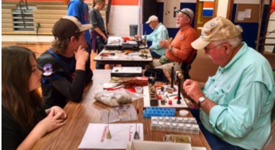
Then Tie Flies