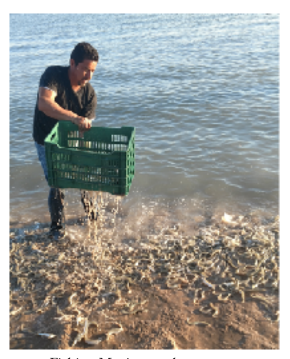
Fishing Mexican style