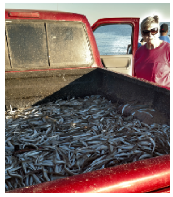
It produces results...Grunion