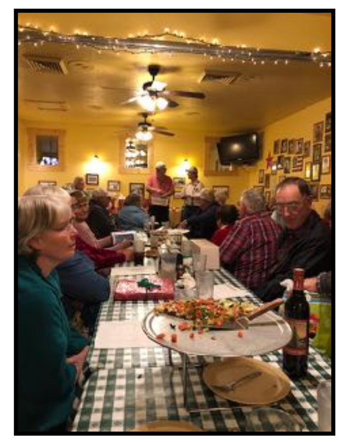
A good time was held by all at the annual Christmas party last month. Looks like I should have been there