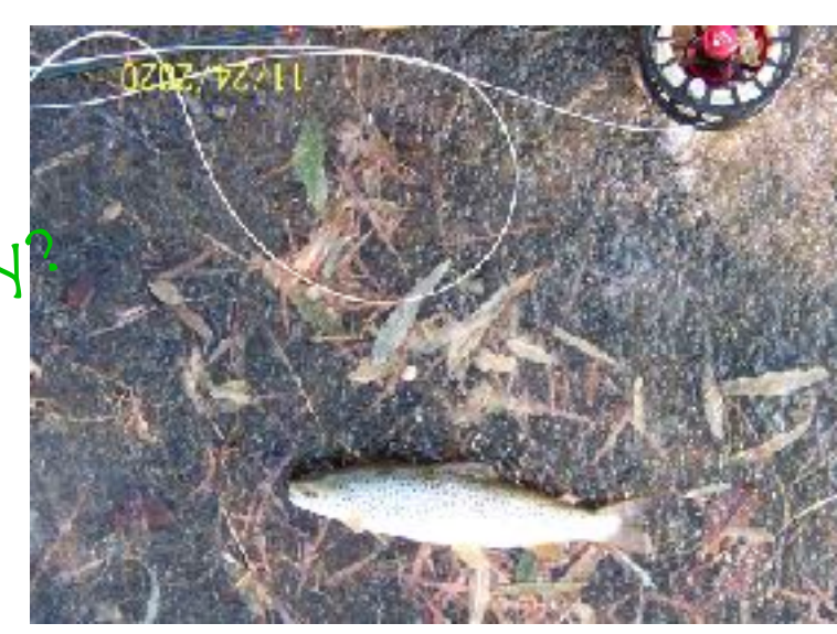
Nov. Owyhee River Brown trout