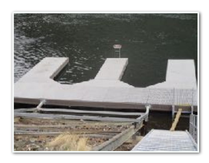
Eight years after they were damaged beyond repair the docks below Hell's Canyon Visitor Center have been replaced. The stairs and railing are also new. There is still work to be done connecting the dock with the stairs.

And from Grant Baugh to honor the "Great Wild Silver".