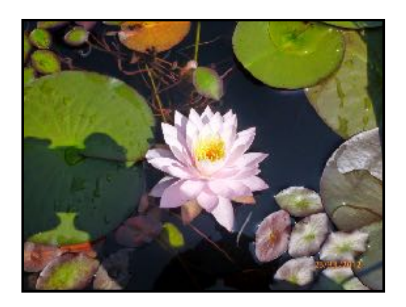
Fishing is not always how many fish you catch. Sometimes it is how beautiful the day is Wentworth lake, Olympic Peninsula, Washington July 2012

e will have a membership meeting on the second Tuesday as usual, but it will be in the Conference room of the Weiser Library. It will start a 7:00 but there will be no fly tying before the meeting.