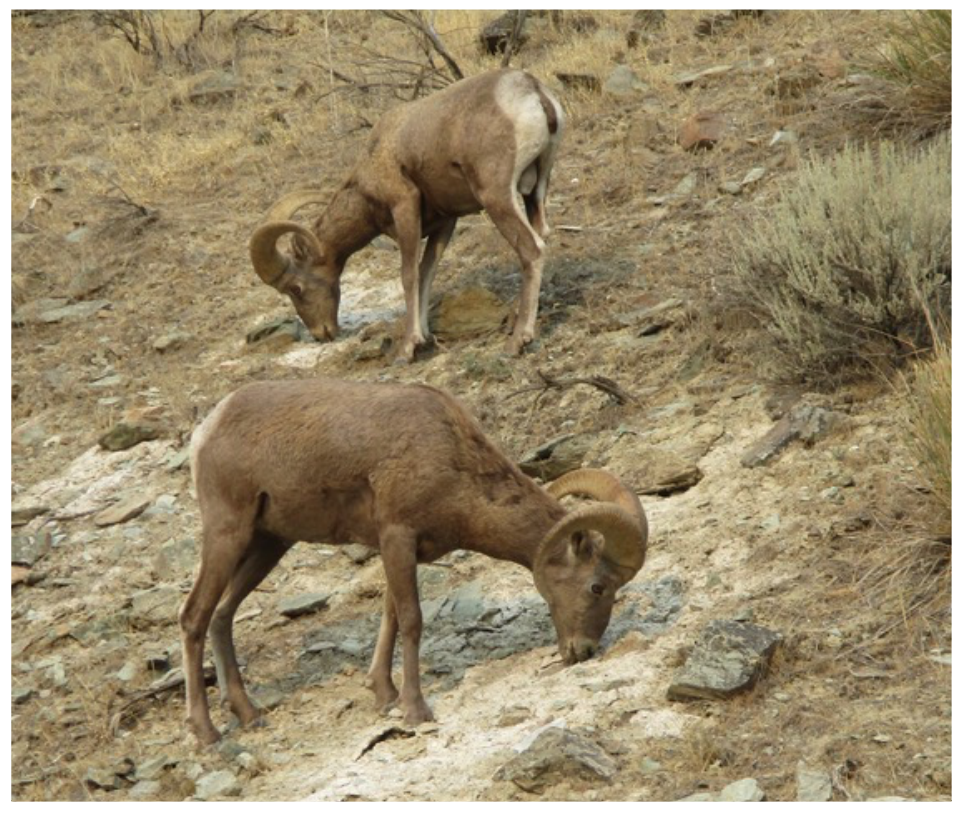
Powder River Canyon on the way home.

Unity Res. Aug. 25 Caught two 19 inchers Lots of algae