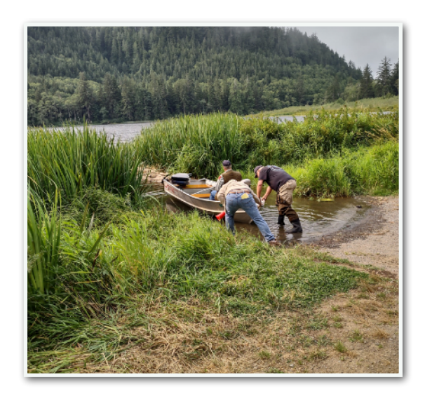
Families and members gathered at the ceremony